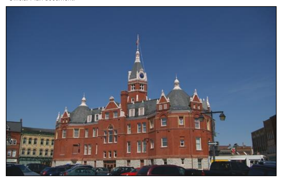
Important discussions may be required at an administrative and political level to confirm the location of Public Meetings, Council Meetings and other statutory requirements under the Planning Act, if the County of Perth Official Plan is the primary and solitary Official Plan document for the Municipality of North Perth to which the recommendations of the NPMGP would be implemented (Implementation Option #4).

Although some administrative and political details may need to be worked out, Implementation Option #4 would ensure consistency with policy, without requiring the creation of a new, additional Official Plan document.