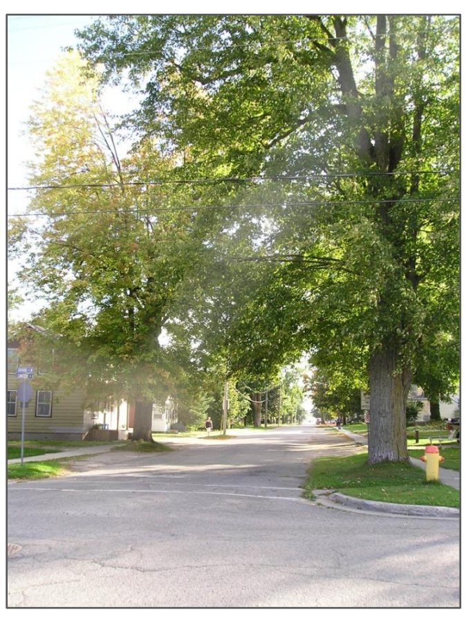
The next important step for the Municipality of North Perth is to ensure the proper implementation of their Master Growth Plan.

and encourage the creation of complete communities. For example, in some cases available land supply if developed would not comply with existing policy, would not provide for efficient and logical development patterns, would avoid the potential for complete community development, would encourage the fragmentation of agricultural lands, and may have adverse impacts to environmental resources and features. As such, the recommendations outlined in the Plan involve the redesignation (or down designation) of such lands within existing, privately serviced settlement areas to ensure a focus of efficient future growth patterns on existing municipal infrastructure and to ensure future development occurs in a manner which is based on good planning principles.